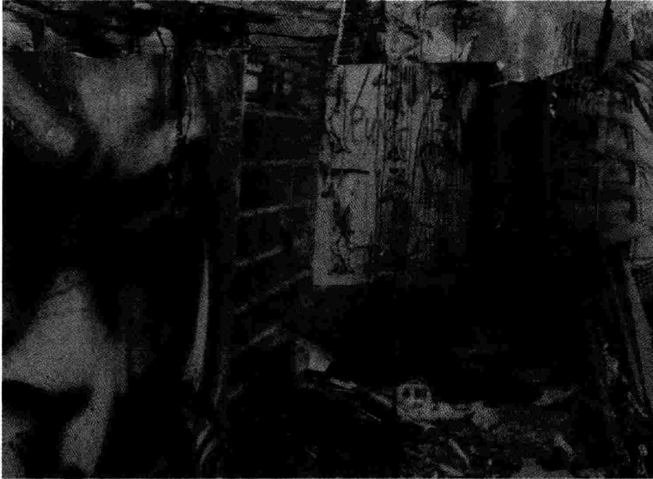
Work from Underexposed